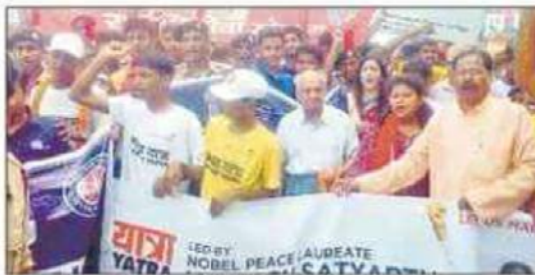
शुक्रवार को फाफामऊ पहुंची भारत यात्रा के साथ एनएसएस कैडेटों एवं स्थानीय नागरिकों ने बालश्रम के खिलाफ रैली निकाल लोगों को जागरूक किया।