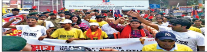
Activists participate in the Bharat Yatra in city on Friday