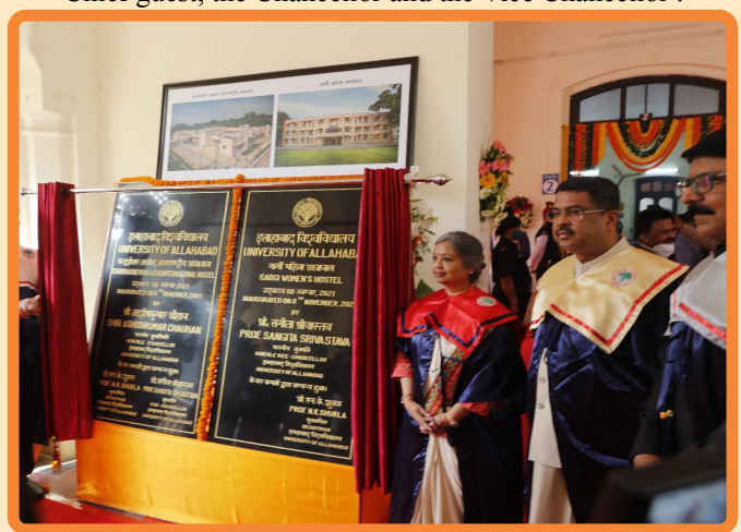
Three buildings were inaugurated by the Hon'ble Minister of Education a girls hostel, an international hostel and the student activity centre.