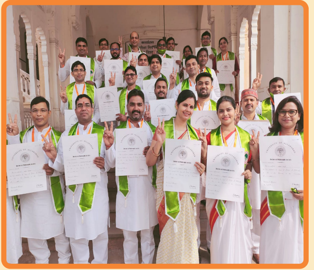
550 DPhil degrees and 263 medals were given during the Convocation 2021