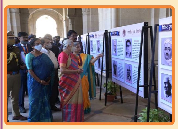
The Hon'ble Governor Smt Anandiben Patel inspected the Photo Gallery at the Vizayanagram Hall