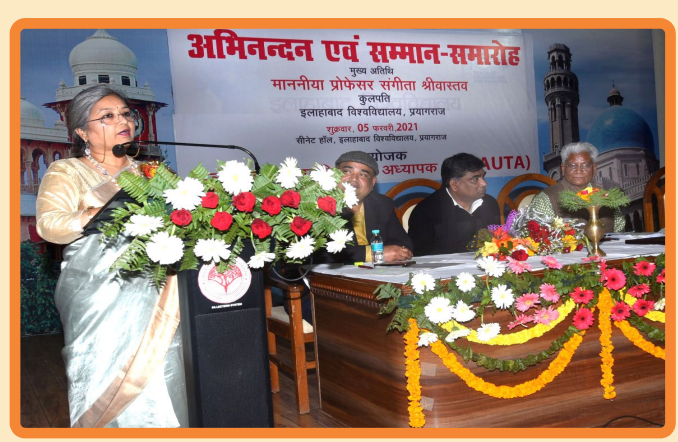
The Vice Chancellor addressed the gathering at the function