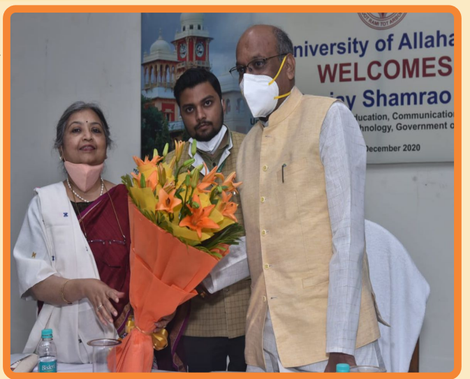
Hon'ble Vice Chancellor welcomes Hon'ble MoS Shri Sanjay Dhotre

A vote of thanks was extended by the registrar Prof. NK Shukla. The minister also inspected the Senate hall building. He was very interested in the Heritage and history of the building and made extensive enquiries. His presence and address has evoked an enthusiastic response from the faculty.