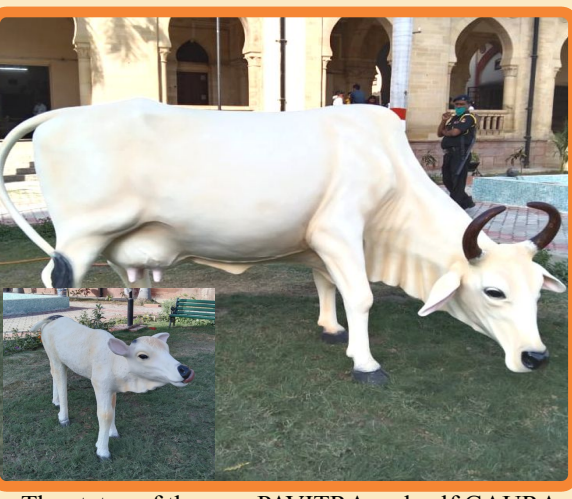
The statue of the cow PAVITRA and calf GAURA setup in the garden of Vazayanagram Hall