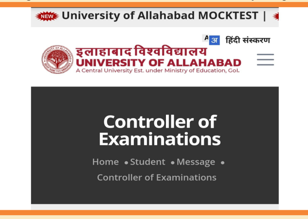
The Examination Committee provided videos of directions and practice link on the University website to help the student give the exam in online mode.