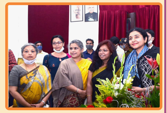
Teachers extended a warm welcome to the Vice Chancellor on the occasion.