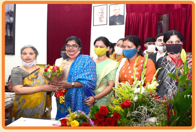
Teachers of the Department of Family and Community Science extending their best wishes to the Vice Chancellor.