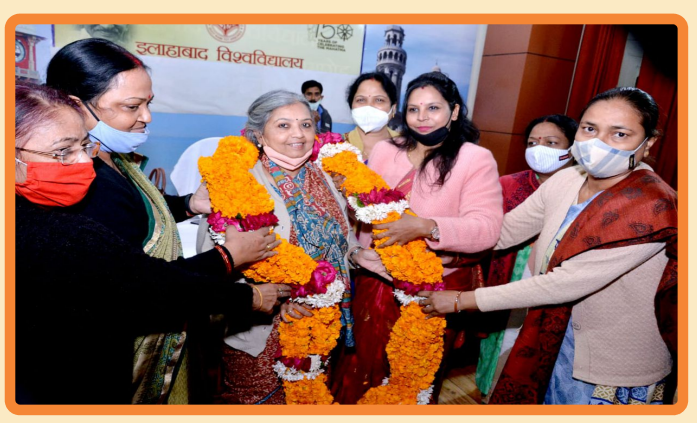
The Vice Chancellor felicitated by the women member of the Employee Union