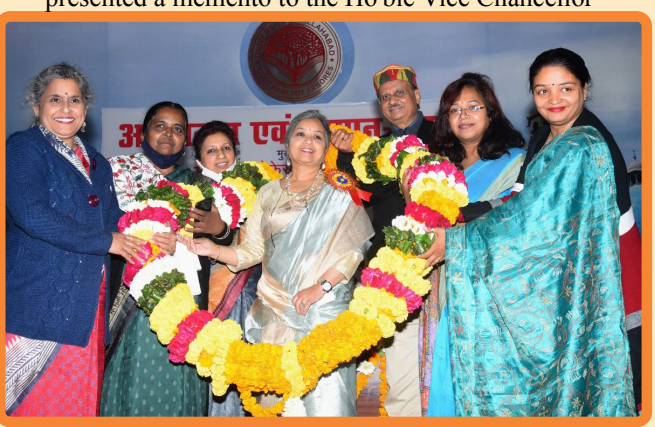
The female faculty felicitated the Hon'ble Vice Chancellor with a special Garland