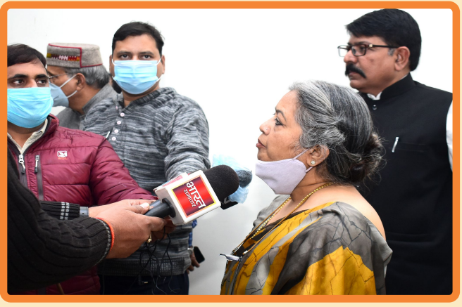
Hon'ble Vice Chancellor addressed the Media after taking charge of the Office