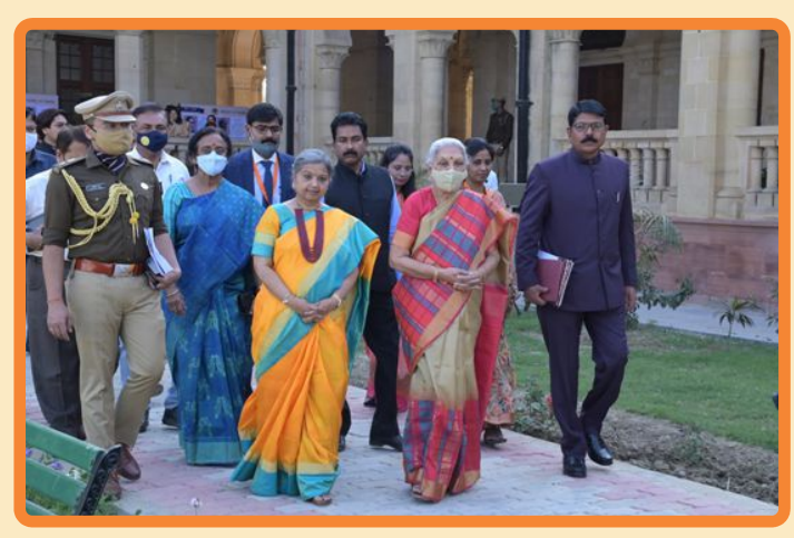
The Hon'ble Governor Smt Anandiben Patel appreciated the beautification of the Vizayanagram Hall Complex.