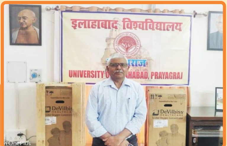
The University provided with oxygen concentrators under CSR