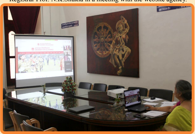
The Vice Chancellor launched the new website in an online meeting