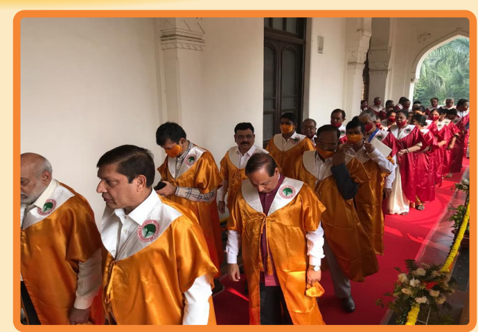
The Registrar led the procession of the Members of the Executive Council and the Academic Council along with the Chief guest, the Chancellor and the Vice Chancellor

Cabinet ministers of Uttar Pradesh government