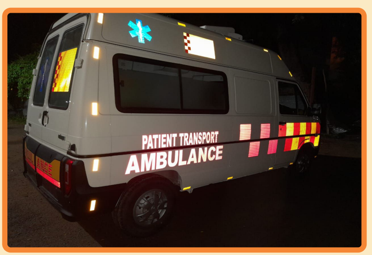
The new ambulance procured by the University