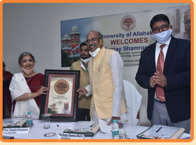
Hon'ble Vice Chancellor present a memento to the Hon'ble MoS Shri S. Dhotre