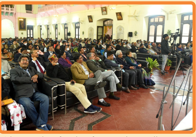
A large number of teachers from constituent colleges were present during the felicitation programme of the AUTA.