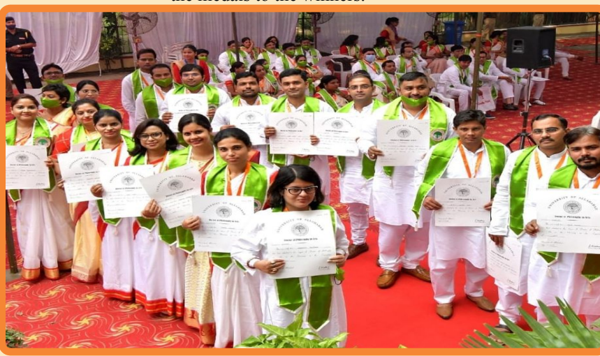
550 scholars were given D Phil degrees during the convocation