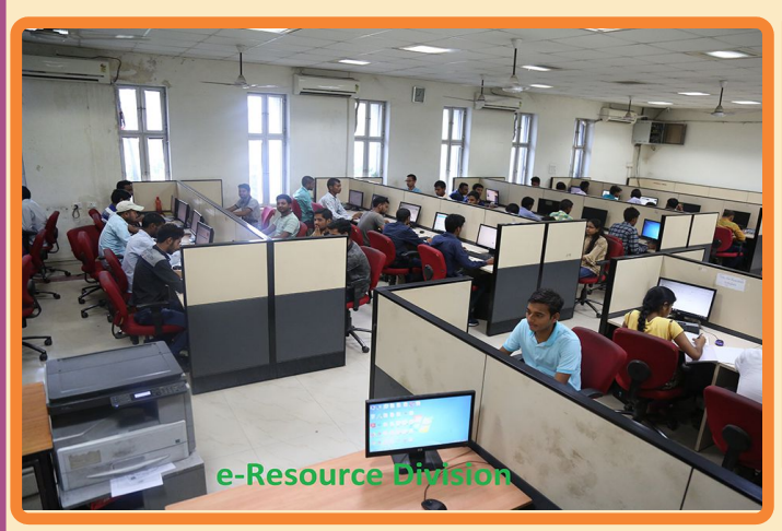
The process of Digitalization of the books and other resources of the library has begun.