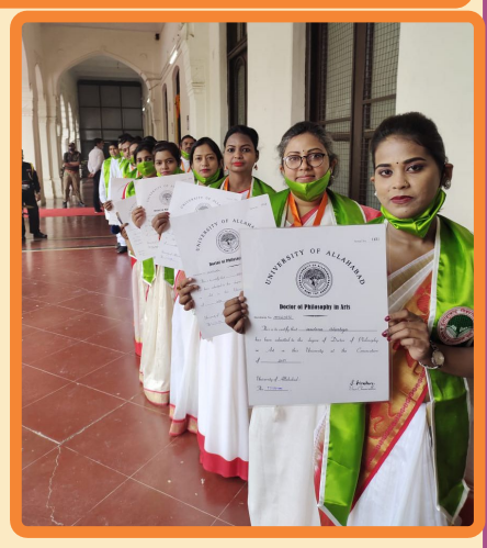
Twelve students received the Chancellor's Medal for sessions 2018-19 and 2019-20