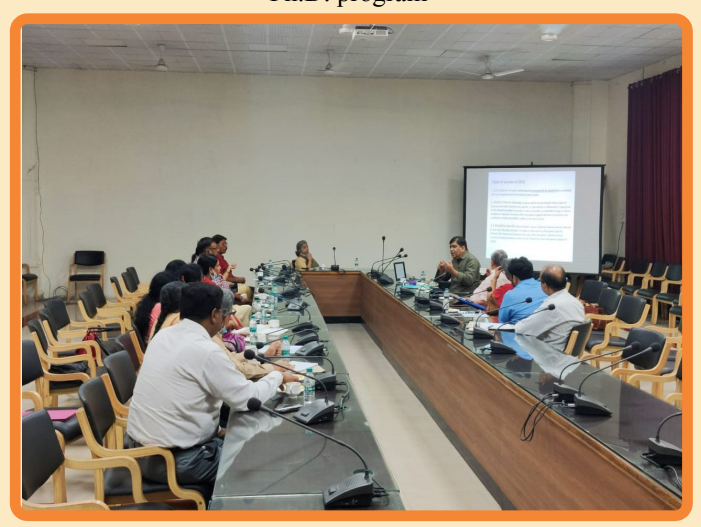
Discussion with Principals of the constituent colleges of the University