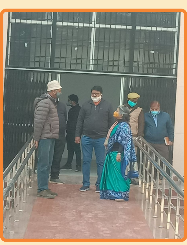
The Hon'ble Vice Chancellor, Registrar, Engg. of University the progress in construction of Ishwar Topa Complex

Several oxygen concentrators have also been given to the university under CSR. A new ambulance has been purchased to enhance the medical facilities.