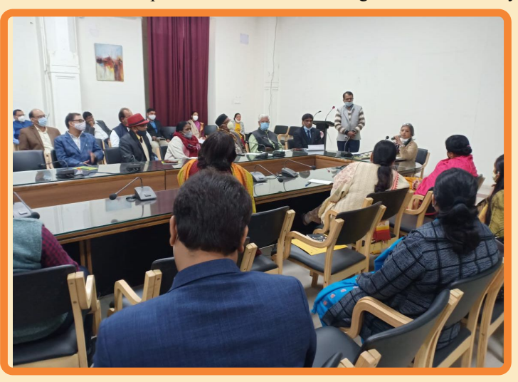
Brainstorming on the NEP with the Deans and the Heads